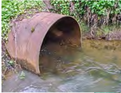
Before – A 4-foot round steel culvert at Mosquito Creek on US 101.

One approach to a stream simulation designed culvert is a bottomless culvert placed over a created streambed that mimics natural conditions.