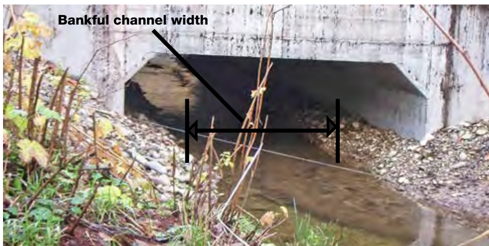
A 2.5 foot culvert was replaced with a 12 foot bottomless culvert. It was constructed in 2012 at an unnamed tributary to the Pysht River on SR 112 near Port Angeles for $1 million.

More information on fish passage design can be found in WDFW’s 2013 edition of Water Crossing Design Guidelines , online at: wdfw.wa.gov/publications/01501