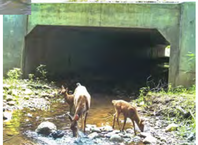
After – A 4-foot-round culvert was replaced with a stream simulation designed culvert that is 16 feet wide at Mosquito Creek on US 101 just southwest of Montesano. This new culvert provides habitat connectivity for deer and other animals as well as 2.2 miles of upstream habitat for fish for $1.4 million in 2009.