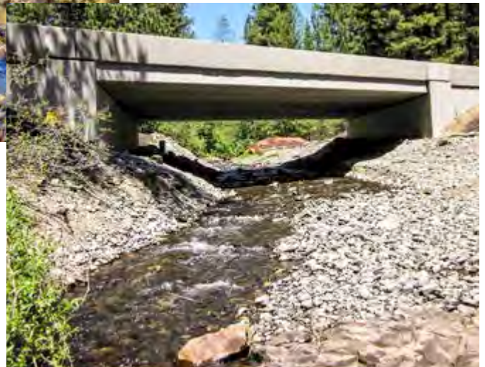
After – The 11 foot culvert was replaced with a 65 foot bridge at Butler Creek at milepost 21.35 in 2012 for $3.5 million.