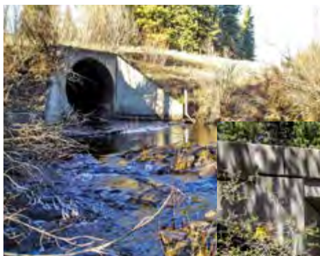
Before – An 11 foot culvert at US 97 at Butler Creek near Goldendale.