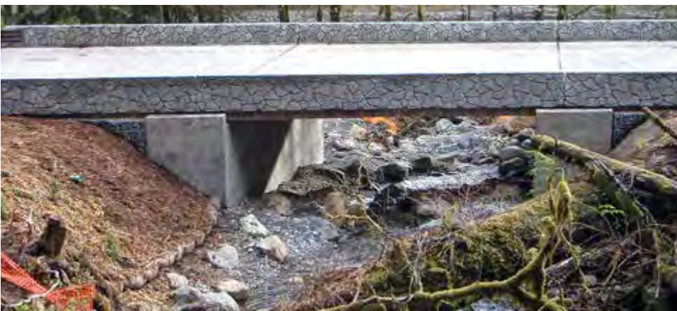
This 40 foot bridge was constructed in 2010 at Chain-Up Creek on SR 542 to replace a 5 foot barrier culvert at milepost 38.98 just east of Maple Falls for $1.3 million.

*Refer to the back page of this publication for more information on the U.S. District court case.