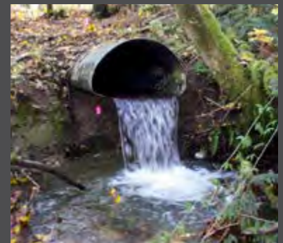
This 5 foot barrier culvert at Fortson Creek was replaced in 2012 with an 18 foot culvert at milepost 42.99 on SR 530 for $1.8 million.